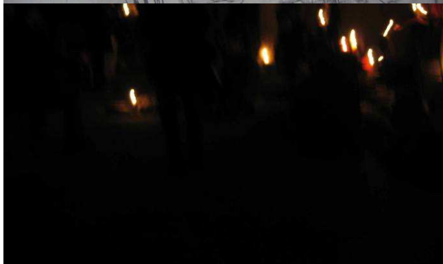
Exhibition „Cata“s at the Kunstkeller Bern 2005 and at the Cité Internationale des Arts Paris 2005