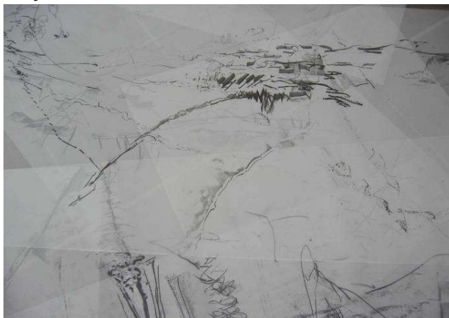
performance with 14 musicians